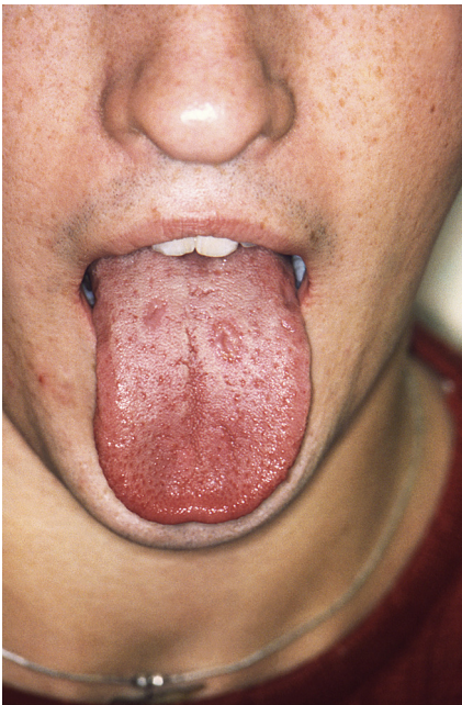
Fig 3 Syphilis in the mouth