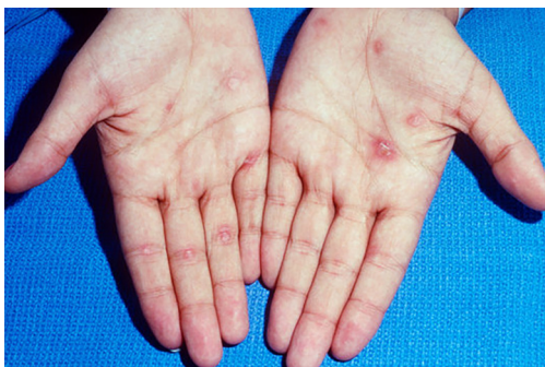
Fig 6 Secondary syphilis on palms of hands