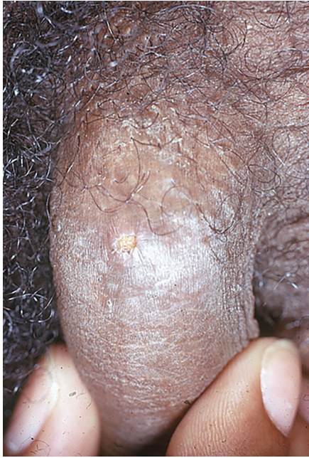
Fig 4 Inconspicuous syphilitic chancre on penis