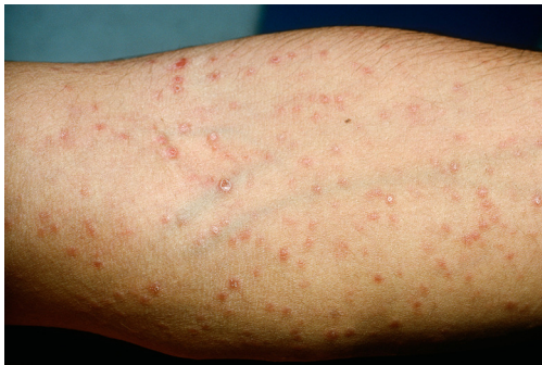
Fig 5 Rash associated with secondary syphilis