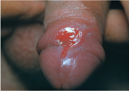
Fig 2 Chancre (sore) on penis due to syphilis